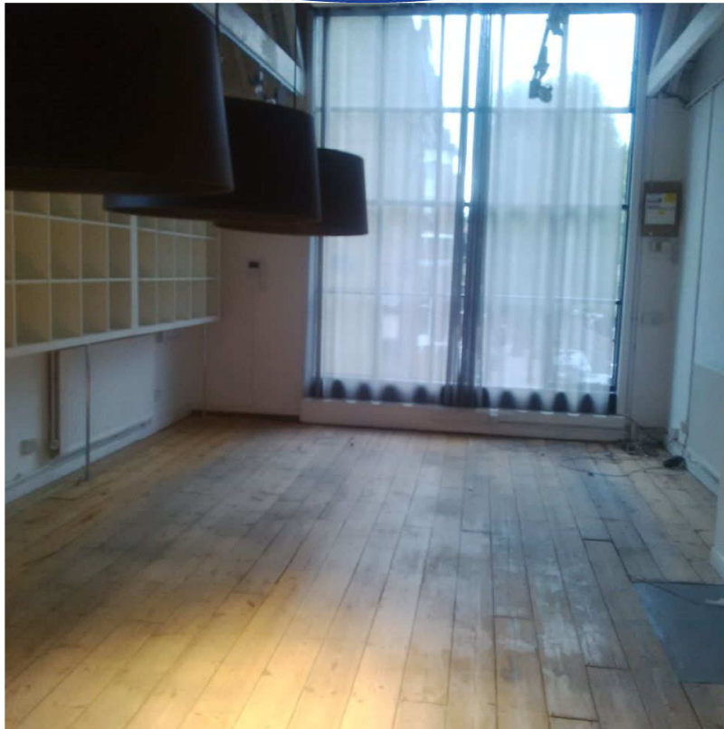
Left hand studio