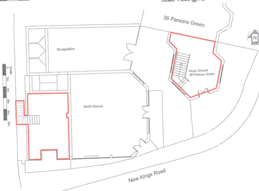
Ground Floor Plan Scale 1:100 @ A3